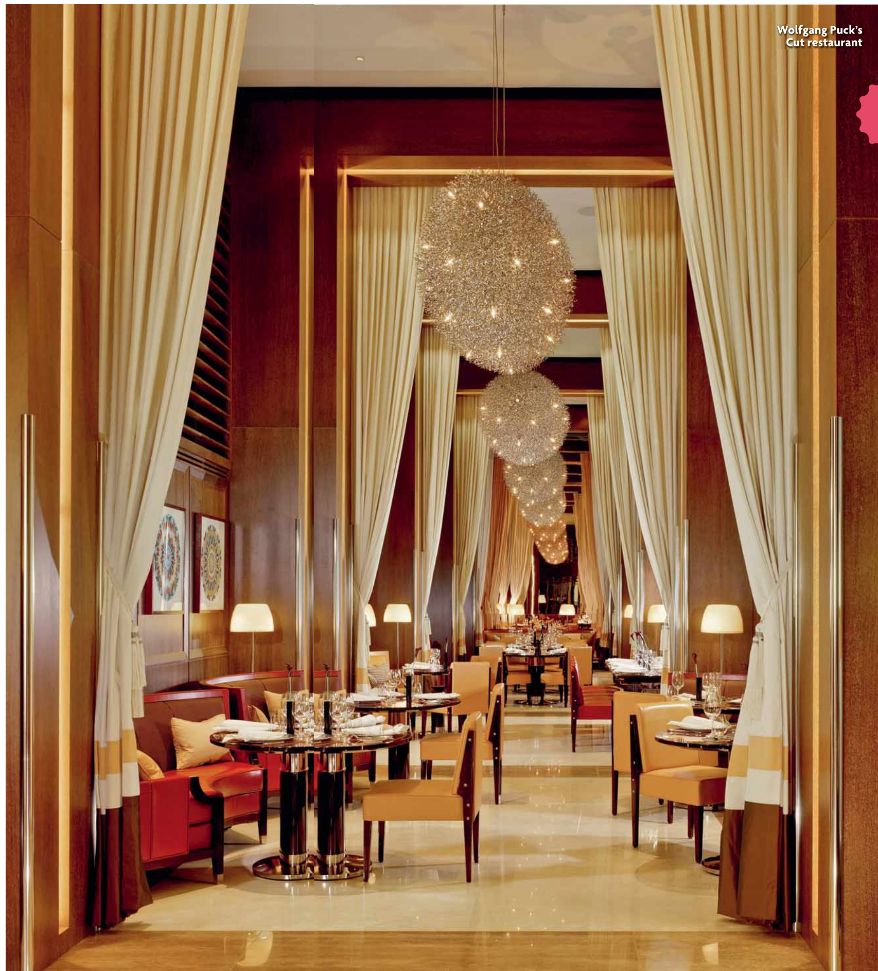
Wolfgang Puck's Cut restaurant