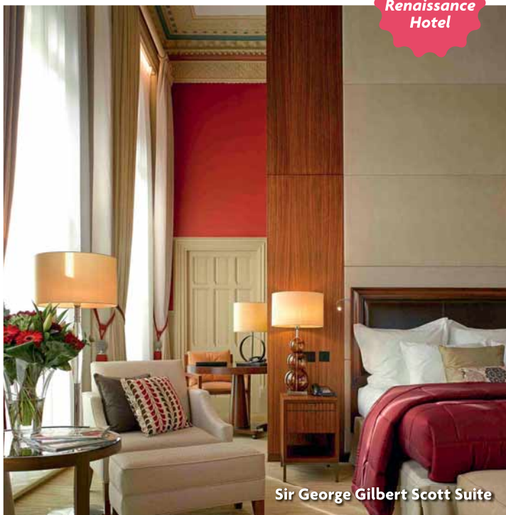
Sir George Gilbert Scott Suite