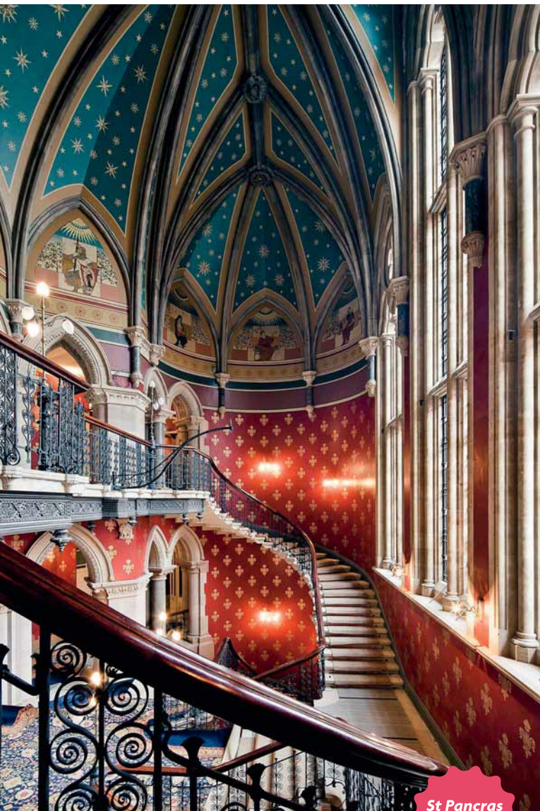
St Pancras Renaissance Hotel