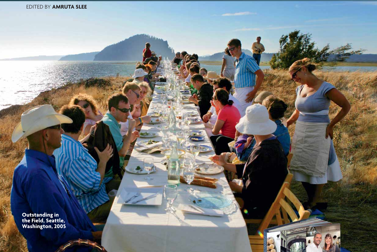
Outstanding in the Field, Seattle, Washington, 2005